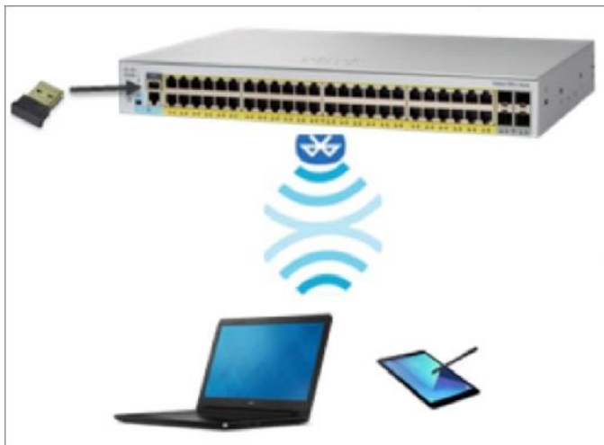
Figure 2. Over-the-air switch access using Bluetooth