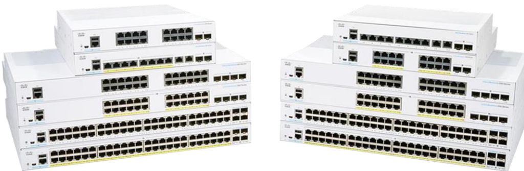
Figure 2. Cisco Business 250 series smart switches

The Cisco Business 250 Series is the next generation of affordable smart switches that combine powerful performance and reliability with a complete suite of the features you need for a solid business network. These switches provide flexible management options, comprehensive security capabilities and Layer 3 static routing features far beyond those of an unmanaged or consumer-grade switch, at a lower cost than for fully managed switches. When you need a reliable solution to share online resources and connect computers, phones, and wireless access points, Cisco Business 250 Series Smart Switches provide the ideal solution at an affordable pricing point.