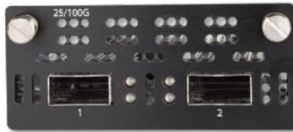
Next Generation Firewall, Next Generation Threat Prevention and Threat Prevention + SandBlast packages