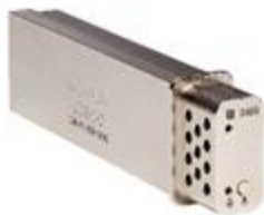
Figure 11. 240-GB SSD storage