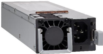
Figure 14. 1600W AC power supply

Tables 7 and 8 provides more details on the Cisco Catalyst 9500 Series power supplies