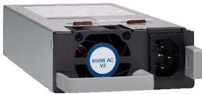
Figure 13. 650W AC power supply