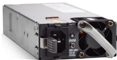
Figure 12. 950W AC power supply

Figures 12 through 14 show the power supplies available for the Cisco Catalyst 9500 Series