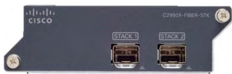
Figure 7. Cisco FlexStack-Extended: Fiber module