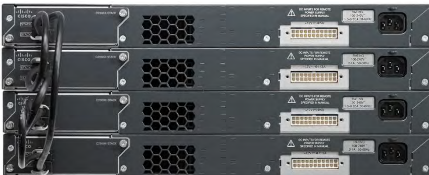
Figure 5. Cisco FlexStack-Plus switch stack