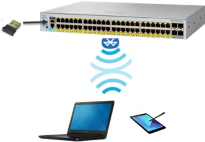
Figure 4. Over-the-air switch access using Bluetooth