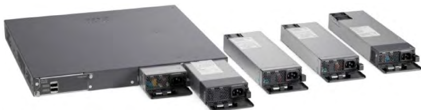
Figure 2. Cisco Catalyst 2960-XR Series power supply

Dual redundant power supplies are supported on the Cisco Catalyst 2960-XR Series Switches. These switches ship with one power supply by default. The second power supply can be purchased at the time of ordering the switch or as a spare. These power supplies have built-in fans to provide cooling (Figure 2).