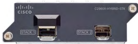
Figure 6. Cisco FlexStack-Extended: Hybrid module