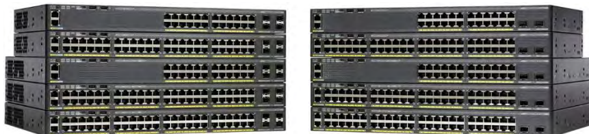
Figure 1. Cisco Catalyst 2960-X Series Switches

Cisco® Catalyst® 2960-X and 2960-XR Series Switches are fixed-configuration, stackable Gigabit Ethernet switches that provide enterprise-class access for campus and branch applications (Figure 1). They operate on Cisco IOS® Software and support simple device management as well as network management. The Cisco Catalyst 2960-X and 2960-XR Series provide easy device onboarding, configuration, monitoring, and troubleshooting. These fully managed switches can provide advanced Layer 2 and Layer 3 features as well as optional Power over Ethernet Plus (PoE+) power. Designed for operational simplicity to lower total cost of ownership, they enable scalable, secure, and energy-efficient business operations with intelligent services. The switches deliver enhanced application visibility, network reliability, and network resiliency.