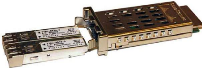
Figure 1. TwinGig Module

TwinGig modules convert a single X2 port into two Gigabit Ethernet SFP ports.