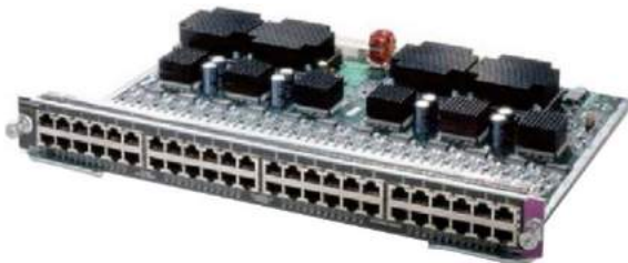
Figure 26. WS-X4248-RJ45V Cisco Catalyst 4500 PoE IEEE 802.3af 10/100, 48 Ports (RJ-45)