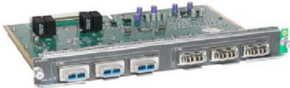
Figure 4. WS-X4606-X2-E Cisco Catalyst 4500E Series 6-Port 10 Gigabit Ethernet (X2)