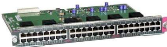
Figure 21. WS-X4548-GB-RJ45 Cisco Catalyst 4500 Enhanced 48-Port 10/100/1000 Module (RJ-45)