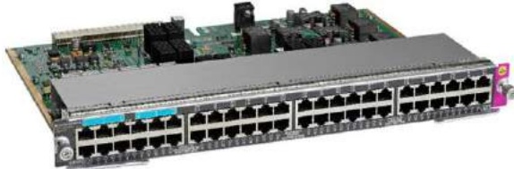
Figure 11. WS-X4748-12X48U+E Cisco Catalyst 4500E Series 48-Port (RJ-45) Line Card with 12 Multigigabit Ports and 36 10/100/1000 Ports with 802.3af PoE, 802.3at PoEP, and UPOE