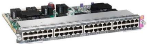
Figure 12. WS-X4748-UPOE+E Cisco Catalyst 4500E Series 48-Port 802.3af PoE, 802.3at PoEP, and UPOE 10/100/1000 (RJ-45)