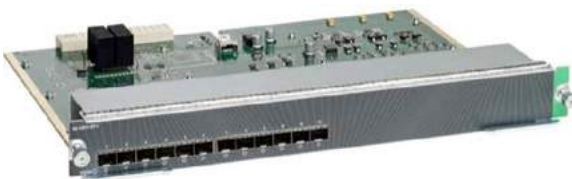
Figure 9. WS-X4612-SFP-E