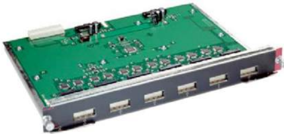
Figure 22. WS-X4306-GB Cisco Catalyst 4500 Gigabit Ethernet Module, 6 Ports (GBIC)