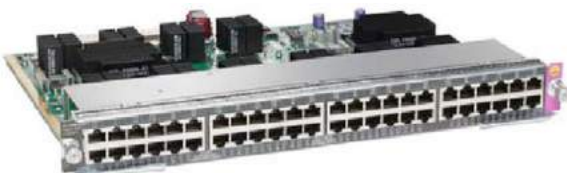
Figure 16. WS-X4648-RJ45V+E Cisco Catalyst 4500E Series 48-Port 802.3af PoE and 802.3at PoEP 10/100/1000 (RJ-45)