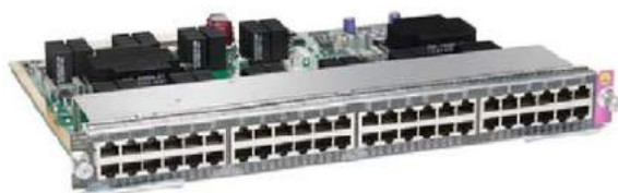
Figure 14. WS-X4748-RJ45V+E Cisco Catalyst 4500E Series 48-Port 802.3af PoE and 802.3at PoEP 10/100/1000 (RJ-45)