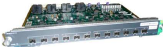
Figure 3. WS-X4712-SFP+E Cisco Catalyst 4500E Series 12-Port 10 Gigabit Ethernet (SFP+)