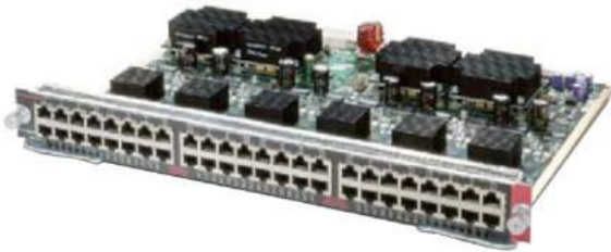
Figure 20. WS-X4548-GB-RJ45V Cisco Catalyst 4500 PoE IEEE 802.3af 10/100/1000, 48 Ports (RJ-45)