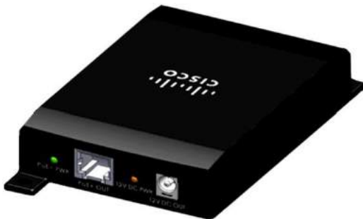
Figure 13. WS-UPOE-12VPSPL Cisco Power Splitter