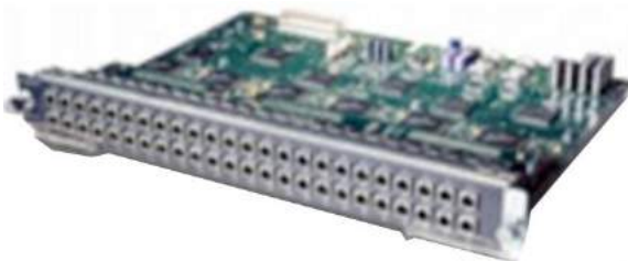
Figure 29. WS-X4148-FX-MT Cisco Catalyst 4500 Gigabit Ethernet Module, 48-Port 100BASE-FX