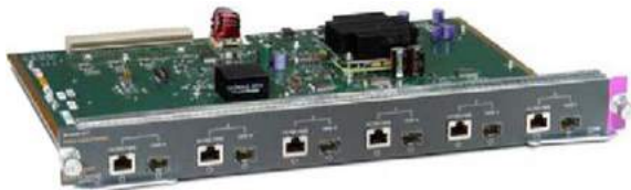
Figure 25. WS-X4506-GB-T Cisco Catalyst 4500 6-Port 10/100/1000 RJ-45 PoE IEEE 802.3af and 1000BASE-X (SFP)