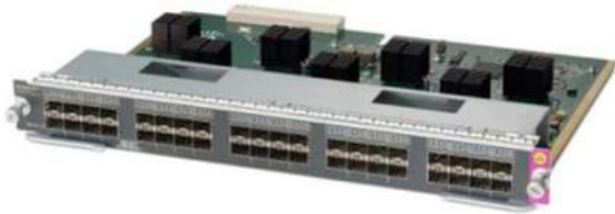
Figure 10. WS-X4640-CSFP-E