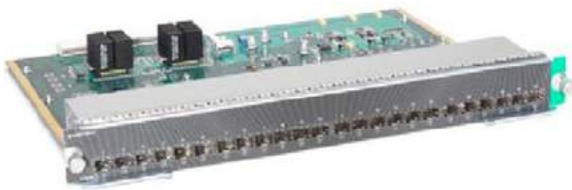
Figure 8. WS-X4624-SFP-E