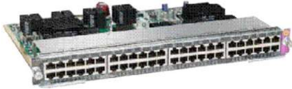
Figure 18. WS-X4648-RJ45-E Cisco Catalyst 4500E Series 48-Port Data-Only 10/100/1000 (RJ-45)