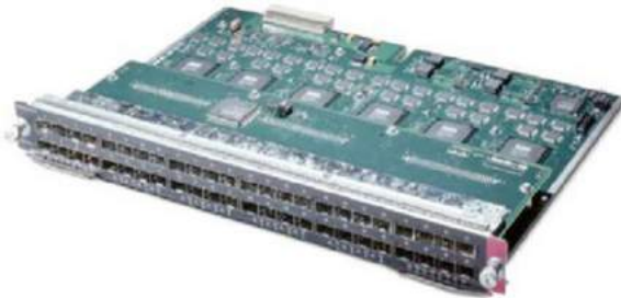
Figure 24. WS-X4448-GB-SFP Cisco Catalyst 4500 Gigabit Ethernet Module, 48 Ports 1000X (SFP)