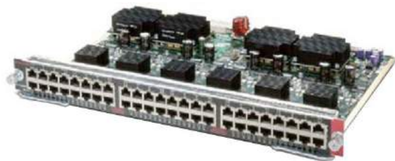
Figure 19. WS-X4548-RJ45V+ Cisco Catalyst 4500 48-Port 802.3af PoE and 802.3at PoEP 10/100/1000 (RJ-45)