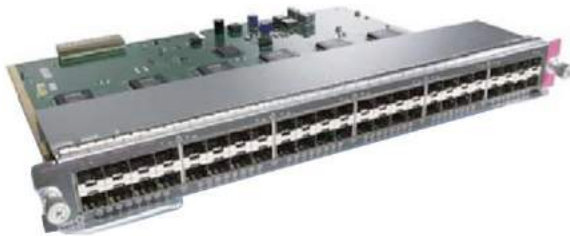
Figure 28. WS-X4248-FE-SFP Cisco Catalyst 4500 Fast Ethernet Switching Module, 48-Port 100BASE-X (SFP)