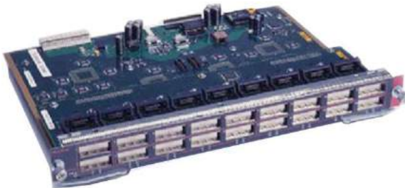
Figure 23. WS-X4418-GB Cisco Catalyst 4500 Gigabit Ethernet Module, Server Switching 18 Ports (GBIC)