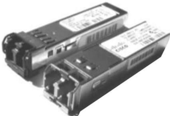
Figure 2. Compact SFP

The Cisco Catalyst 4500E Series 40 module Gigabit line card (2:1 oversubscribed) provides switching at 24Gbps per slot and can be used for enterprise deployments that require higher density and lower oversubscription. This line card also supports a specialized BX optics (compact SFP) that doubles the density to 80 ports per line card using 40 module, making it attractive for the FTTH deployment. The CSFP is a dual bidirectional SFP type that has the same form factor as a regular SFP, but can support 2 users that use BX type of optics (Figure 2).