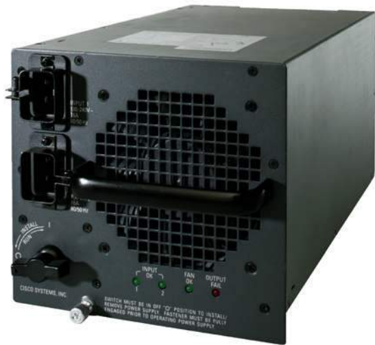
Figure 1. Cisco Catalyst 6500 Series Chassis

All Cisco Catalyst 6500 Series chassis hold up to two load-sharing, fault-tolerant, hot-swappable power supplies. Only one supply is required to operate a fully loaded chassis. If a second supply is installed, it operates in a load-sharing capacity. The power supplies are hot-swappable—a failed power supply can be removed without powering off the system.