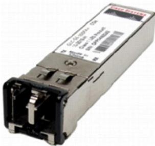
Figure 1. Cisco 100M Ethernet SFP