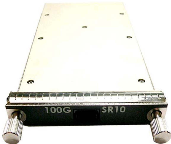
Figure 2. Cisco CFP-100G-SR10 module