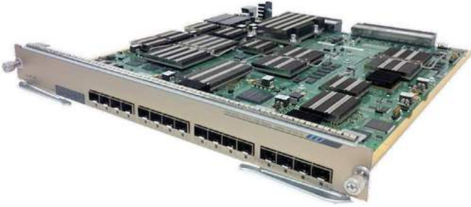
Figure 2. 6800 Series 16-Port 10-Gigabit Ethernet Fiber Module