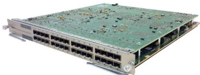
Figure 1. 6800 Series 32-Port 10-Gigabit Ethernet Fiber Module.

The C6800 Family 32-port 10-Gigabit Ethernet Fiber module provides up to 160 10-Gigabit Ethernet fiber ports in a single Cisco Catalyst 6807-XL Switch chassis or up to 320 10-Gigabit Ethernet fiber ports in a Cisco Catalyst 6807-XL Virtual Switching System (VSS) 2T. It also provides up to 352 10-Gigabit Ethernet fiber ports in a single Cisco Catalyst 6513-E Switch chassis, or up to 704 10-Gigabit Ethernet fiber ports in a Cisco Catalyst 6500 VSS 2T.