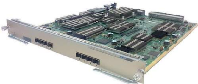
Figure 3. 6800 Series 8-Port 10-Gigabit Ethernet Fiber Module

The C6800 Family 8-port 10-Gigabit Ethernet Fiber module provides up to 40 10-Gigabit Ethernet fiber ports in a single Cisco Catalyst 6807-XL Switch chassis, or up to 80 10-Gigabit Ethernet fiber ports in a Cisco Catalyst 6807-XL Virtual Switching System (VSS) 2T. It also provides up to 88 10-Gigabit Ethernet fiber ports in a single Cisco Catalyst 6513-E Switch chassis or up to 176 10-Gigabit Ethernet fiber ports in a Cisco Catalyst 6500 Virtual Switching System (VSS) 2T.