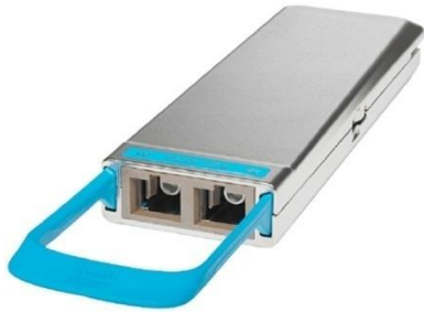
Figure 2. Cisco CPAK-100GE-LR4 Module with LC Connectors