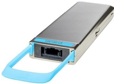
Figure 4. Cisco CPAK-10X10G-LR Module

The Cisco CPAK-10X10G-LR module is used in 10 x 10Gb mode along with ribbon-to-duplex SMF breakout cables for connectivity to ten 10GBASE-LR optical interfaces. It supports link lengths up to 10km over standard SMF, G.652. The module delivers 100-Gbps links over 24-fiber ribbon cables terminated with MPO/MTP connectors.