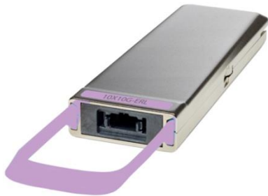
Figure 6. Cisco CPAK-10X10G-ERL Module

The Cisco CPAK-10X10G-ERL module is used in 10 x 10Gb mode along with ribbon-to-duplex SMF breakout cables for connectivity to ten 10GBASE-ER optical interfaces. It supports link lengths up to 25km over standard SMF, G.652. The module delivers 100Gbps links over 24-fiber ribbon cables terminated with MPO/MTP connectors.