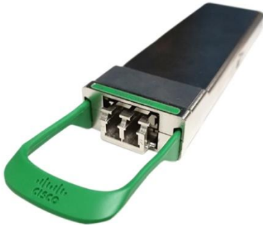
Figure 8. Cisco CPAK-100G-CWDM4 Module