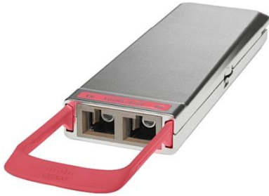
Figure 3. Cisco CPAK-100G-ER4L Module