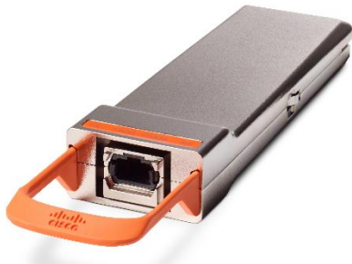
Figure 9. Cisco CPAK-100G-PSM4 Module

The Cisco CPAK-100G-PSM4 Module supports link lengths of up to 500 meters over Single-Mode Fiber (SMF) with MPO connectors. The 100 Gigabit Ethernet signal is carried over 12-fiber parallel fiber terminated with MPO multifiber connectors.