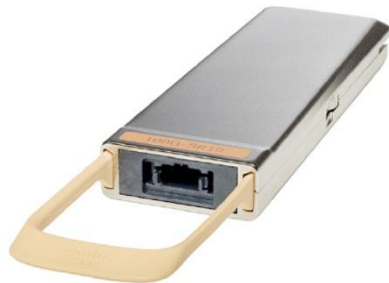
Figure 5. Cisco CPAK-100G-SR10 Module

The Cisco CPAK-100G-SR10 module delivers 100-Gbps links over 24-fiber ribbon cables terminated with MPO/MTP connectors. It can also be used in 10 x 10Gb mode along with ribbon-to-duplex-fiber breakout cables for connectivity to ten 10GBASE-SR optical interfaces. It supports link lengths of 100m and 150m on laser-optimized OM3 and OM4 multifiber cables, respectively.