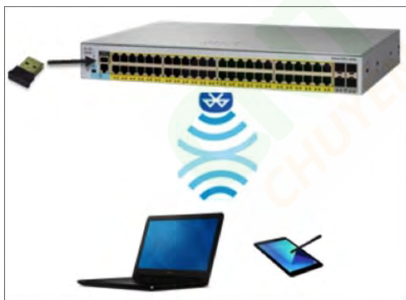
Figure 2. Over-the-air switch access using Bluetooth