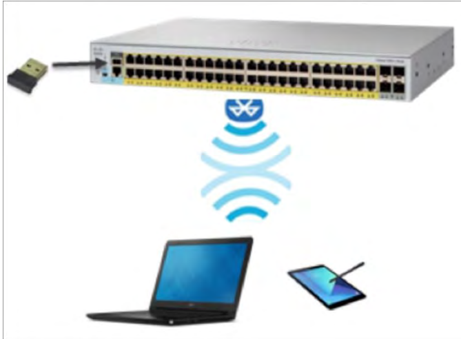
Figure 2. Over-the-air switch access using Bluetooth