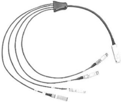
Figure 2. Cisco QSFP to Four SFP+ copper breakout cables