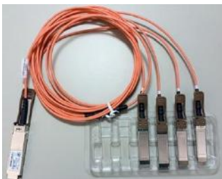
Figure 4. Cisco 40G QSFP to Four SFP+ breakout active optics cables

Cisco QSFP to four SFP+ active optical breakout cables (Figure 4) are suitable for very short distances and offer a flexible way to connect within racks and across adjacent racks. Active optical cables are much thinner and lighter than copper cables, which makes cabling easier. Active optical cables enable efficient system airflow and have no ElectroMagnetic Interference (EMI) issues, which is critical in high-density racks. These breakout cables connect to a 40G QSFP port of a Cisco switch on one end and to four 10G SFP+ ports of a Cisco switch on the other end. Cisco currently offers active optical breakout cables in lengths of 1, 2, 3, 5, 7, and 10 meters.