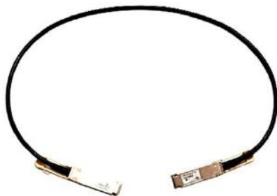
Figure 3. Cisco 40GBASE-CR4 QSFP direct-attach copper cables

Cisco QSFP to QSFP copper direct-attach 40GBASE-CR4 cables (Figure 3) are suitable for very short distances and offer a very cost-effective way to establish a 40-gigabit link between QSFP ports of Cisco switches within racks and across adjacent racks. Cisco currently offers passive cables in lengths of 0.5, 1, 2, 3, 4 and 5 meters and active cables in lengths of 7 and 10 meters.