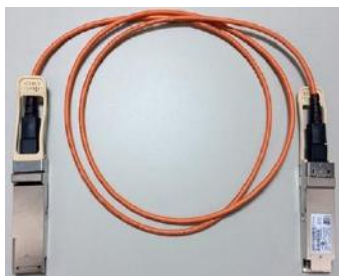
Figure 5. Cisco 40G QSFP active optics cables

Cisco QSFP to QSFP copper direct-attach 40GBASE-CR4 cables (Figure 5) are suitable for very short distances and offer a flexible way to connect within racks and across adjacent racks. Active optical cables are much thinner and lighter than copper cables, which makes cabling easier. Active optical cables enable efficient system airflow and have no EMI issues, which is critical in high-density racks. Cisco currently offers active optical cables in lengths of 1, 2, 3, 5, 7, 10, 15, 20, 25 and 30 meters.