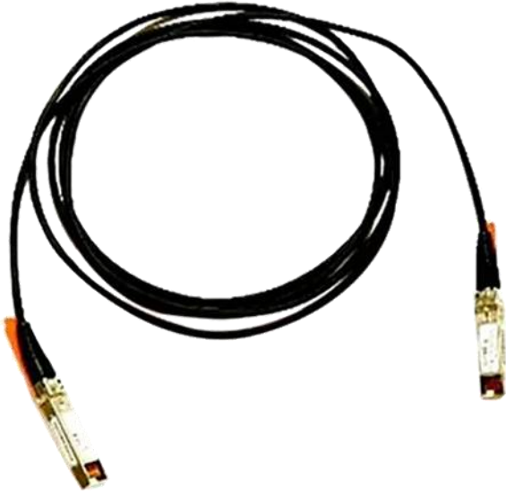
Figure 4. Cisco direct-attach twinax copper cable assembly with SFP+ connectors

Cisco SFP+ Copper Twinax (Figure 4) direct-attach cables are suitable for very short distances and offer a cost-effective way to connect within racks and across adjacent racks. Cisco offers passive Twinax cables in lengths of 1, 1.5, 2, 2.5, 3, 4 and 5 meters, and active Twinax cables in lengths of 7 and 10 meters.