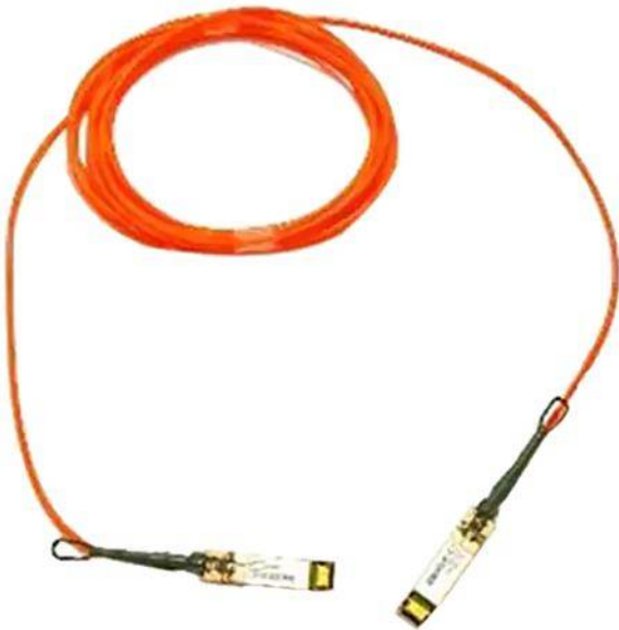
Figure 5. Cisco direct-attach active optical cables with SFP+ connectors

Cisco SFP+ Active Optical Cables (Figure 5) are direct-attach fiber assemblies with SFP+ connectors. They are suitable for very short distances and offer a cost-effective way to connect within racks and across adjacent racks. Cisco offers Active Optical Cables in lengths of 1, 2, 3, 5, 7, and 10 meters.