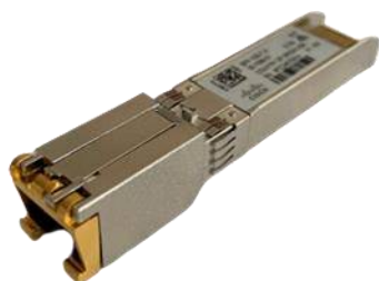
Figure 2. Cisco SFP+ 10GBASE-T module with RJ-45 connector

The Cisco 10GBASE-T module (Figure 2) offers connectivity options at the following data rates: 100M/1G/10Gbps. It has the SFP+ form factor and an RJ-45 interface so that CAT5e/CAT6A/CAT7 cables can be used to connect to end points with embedded 10GBASE-T ports. They are suitable for distances up to 30 meters and offers a cost-effective way to connect within racks and across adjacent racks.