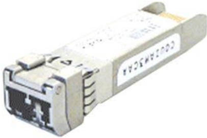
Figure 1. Cisco 10GBASE SFP+ modules

The Cisco® 10GBASE SFP+ modules (Figure 1) give you a wide variety of 10 Gigabit Ethernet connectivity options for data center, enterprise wiring closet, and service provider transport applications.