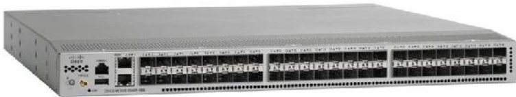
Figure 1. Cisco Nexus 3548 and 3524 Switch

The Cisco Nexus 3548 and 3524 have the following hardware configuration: