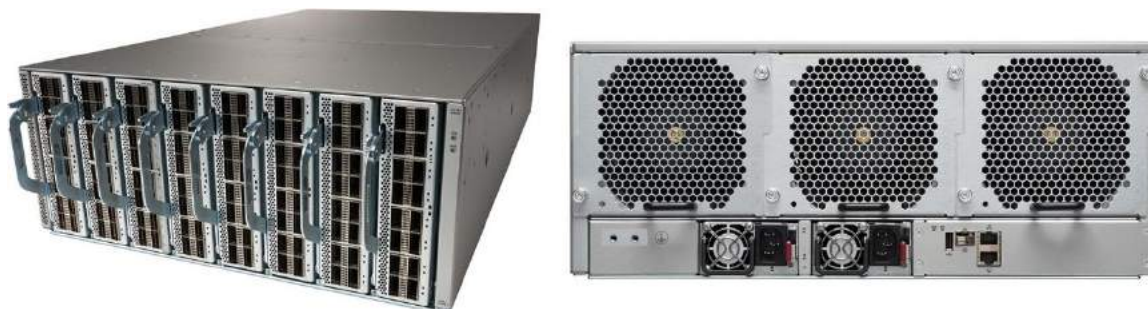
Figure 1. Cisco Nexus 3408-S

The Cisco Nexus 3408-S (Figure 1) is a 4-Rack-Unit (RU), 8-slot chassis with the flexibility of 100G or 400G Line-Card Expansion Modules (LEMs) offering 128 ports of 100G or 32 ports of 400G. The Cisco Nexus 3408-S is the industry's highest port radix in a compact and energy-efficient form factor. The Cisco Nexus 3408-S supports HVAC/DC power inputs with forward airflow direction.