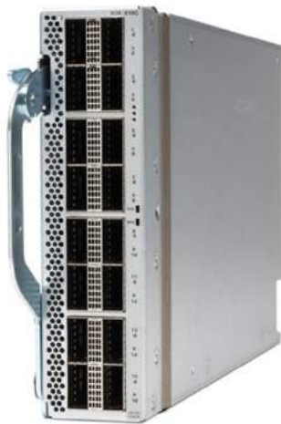
Figure 2. Cisco Nexus NXM-X16C, 16 ports of 100G

The 100G LEMs are 16 ports of QSFP28 supporting 100, 50, 40, 25, and 10G speeds.