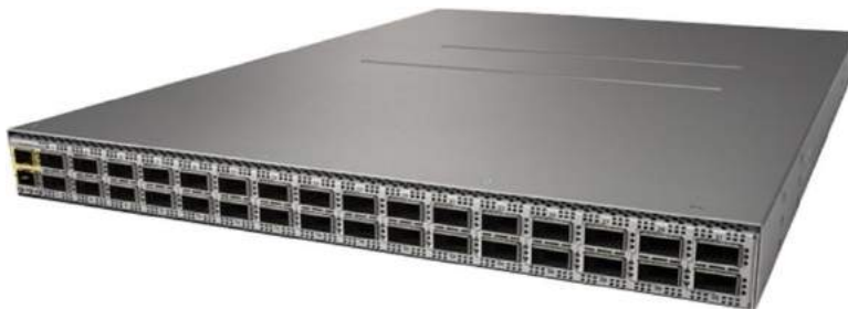
Figure 1. Cisco Nexus 3432D-S Switch

The Cisco Nexus 3432D-S (Figure 1) is a Quad Small Form-Factor Pluggable – Double Density (QSFP-DD) switch with 32 ports that are backward-compatible with QSFP+, QSFP28, and QSFP56. Each QSFP-DD port can operate at 400, 100, 50, 40, and 25 Gbps.