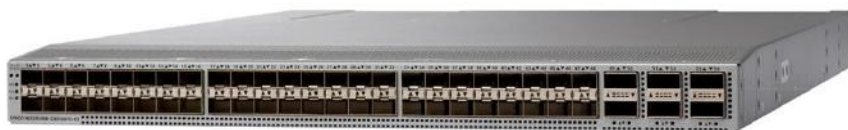
Figure 1. Cisco Nexus 93180YC-EX Switch

The Cisco Nexus 93180YC-EX Switch (Figure 1) is a 1-Rack-Unit (1RU) switch with latency of less than 1 microsecond that supports 3.6 Terabits per second (Tbps) of bandwidth and over 2.6 billion packets per second (bps). The 48 downlink ports on the 93180YC-EX can be configured to work as 1-, 10-, or 25-Gbps ports, offering deployment flexibility and investment protection. The uplink can support up to six 40- and 100-Gbps ports, or a combination of 1-, 10-, 25-, 40-, 50, and 100-Gbps connectivity, offering flexible migration options. The switch has FC-FEC enabled for 25Gbps, and supports upto 3m in DAC connectivity. Please check Cisco Optics Matrix for the most updated support.