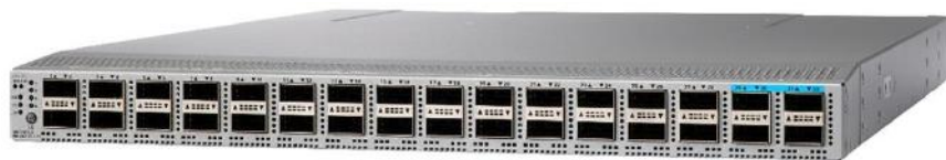
Figure 3. Cisco Nexus 93180LC-EX Switch

The Cisco Nexus 93180LC-EX Switch is the industry's first 50-Gbps-capable 1RU switch that supports 3.6 Tbps of bandwidth and over 2.6 bpps across up to 32 fixed 40- and 50-Gbps QSFP+ ports or up to 18 fixed 100-Gbps ports (Figure 3). The switch can support up to 72 10-Gbps ports using breakout cables. A variety of flexible port configurations are supported using templates.