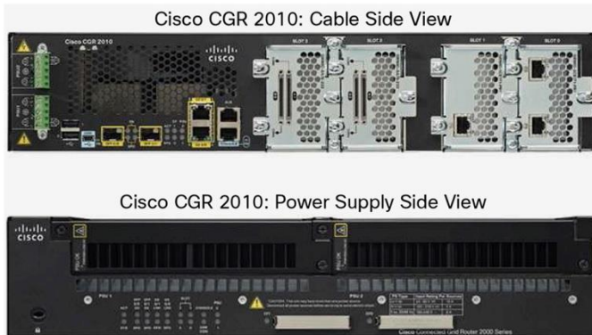
Figure 1. Cisco CGR 2010