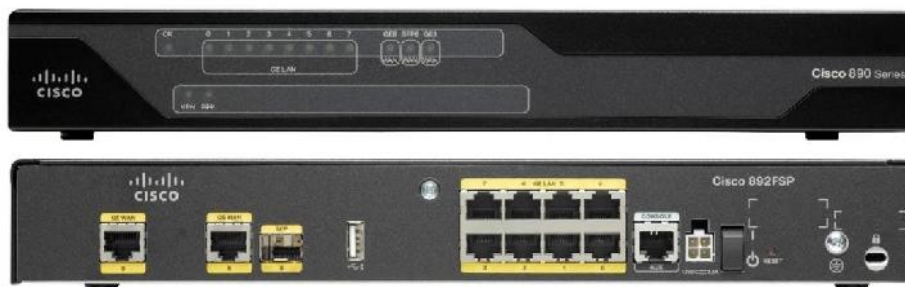
Figure 1. Cisco 892FSP ISR, Front and Back

Cisco 890 Series ISRs come with an 8-port managed switch, providing LAN ports to connect multiple devices. An optional Power-over-Ethernet (PoE) capability can also supply power to IP phones and other devices. Eleven Cisco 890 Series models are available: Figure 1 shows the front and back of one, the Cisco 892FSP.