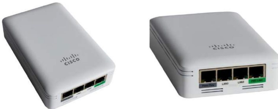
Figure 1. Cisco Aironet 1815w Access Point

Packing 802.11ac Wave 2 wireless standards support and Gigabit Ethernet wired connectivity into a sleek device, the 1815w is built to take full advantage of existing cabling infrastructure while blending into the visual footprint. This combination provides best-in-class performance while reducing total cost of ownership.