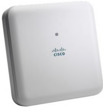
Figure 1. Cisco Aironet 1830 Series