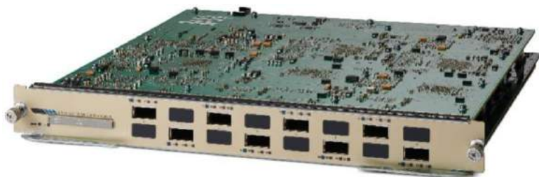
Figure 1. 6800 Series 8-Port 40 Gigabit Ethernet Module