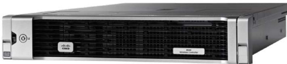
Figure 1. Cisco 8540 Wireless Controller

The Cisco Digital Network Architecture (Cisco DNA) is an open and extensible, software-driven architecture that accelerates and simplifies your enterprise network operations. The programmable architecture frees your IT staff from time-consuming, repetitive network configuration tasks so they can focus instead on innovation that positively transforms your business. SD-Access, as part of Cisco DNA, enables policy-based automation from edge to cloud with foundational capabilities. Cisco DNA Assurance, also part of Cisco DNA, provides a single source to monitor, modify, and manage your network and application data.