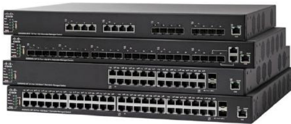
Figure 1. Cisco 550X Series Stackable Managed Switches

Cisco 550X Series switches are designed to protect your technology investment as your business grows. Unlike switches that claim to be stackable but have elements that are administered and troubleshot separately, the Cisco 550X Series provides true stacking capability, allowing you to configure, manage, and troubleshoot multiple physical switches as a single device and more easily expand your network.