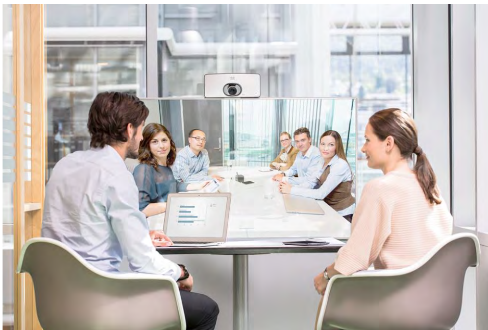
Figure 1. Cisco SX10 Quick Set in a Huddle Space

High quality, simplicity, and affordability come together in the SX10 Quick Set to create a practical and powerful business class solution for video ubiquity (Figures 1 through 3).