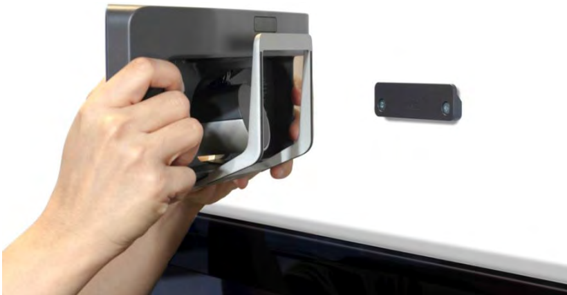
Figure 3. Cisco SX10 Wall-Mount Solution