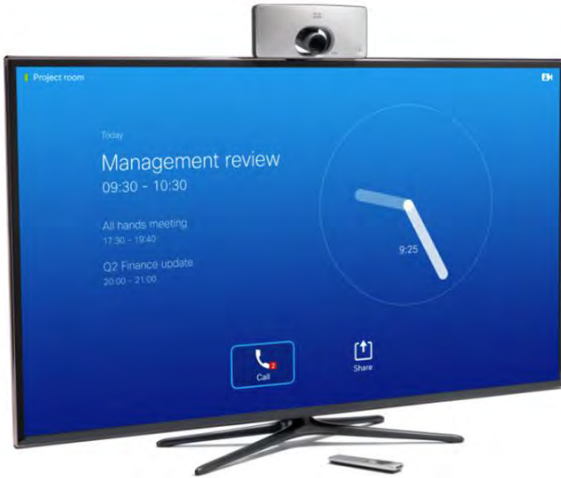
Figure 2. Cisco SX10 Quick Set Mounted with Remote Control