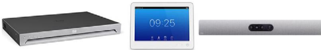
Figure 2. Cisco SX80 Integrator Package with Touch 10 and Quad Camera

With its powerful media engine, the SX80 Codec lets you build the video collaboration room of your dreams.