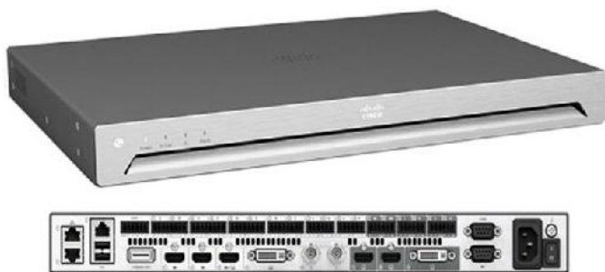
Figure 1. Cisco SX80 Codec