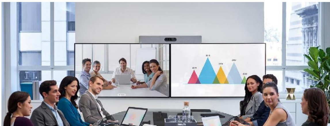
Figure 1. Cisco Webex Room Kit Plus in Large Conference Room

The Room Kit Plus - comprising a powerful codec and a quad-camera bar with integrated speakers and microphones* - is ideal for rooms that seat up to 14 people. It offers sophisticated camera technologies that bring speaker-tracking and auto-framing capabilities to medium to large-sized rooms. The product is rich in functionality and experience but is priced and designed to be easily scalable to all of your conference rooms and spaces - whether registered on the premises or to Cisco Webex.