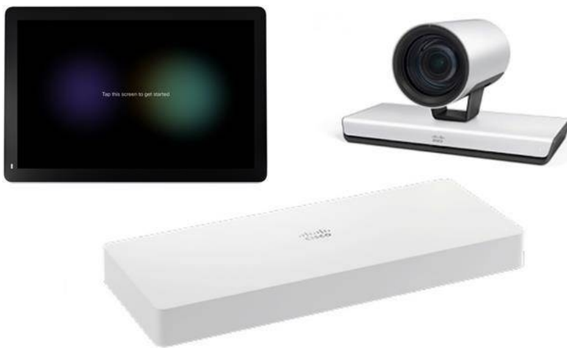
Figure 1. Cisco Webex Room Kit Plus Precision 60 integrator package

The Room Kit Plus P60 integrator package is rich in functionality and experience but is priced and designed to be easily scalable to all of your collaboration spaces – whether registered on the premises or to Cisco Webex in the cloud.