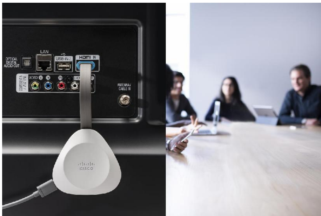
Figure 3. Webex Share installation

Cisco Webex Share is installed behind the screen (Figure 4). The package includes a cable management sticker that allows users to correctly position the device behind the display and to avoid mechanical stress on the HDMI port. The HDMI cable has been designed to sustain the device weight.