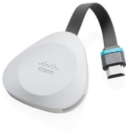
Figure 1. Cisco Webex Share

Cisco Webex Share complements the premium portfolio of Cisco Webex collaboration devices, enabling conference rooms and huddle spaces to offer the same Webex user experience as Cisco's video devices.