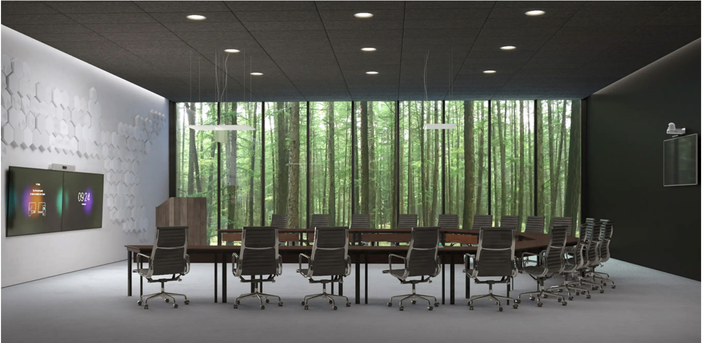
Figure 1. Webex Room Kit Plus PTZ 4K bundle with an additional Webex Quad Camera unit in a large conference room

The Webex® Room Kit Plus PTZ 4K Integrator Bundle is a powerful collaboration solution that integrates with up to two flat-panel displays to bring more intelligence and versatility to your collaboration spaces. This package combines the performance of the Webex Codec Pro collaboration engine, the flexibility of the Webex PTZ 4K pan-tilt-zoom camera and the purpose-built Webex Room Navigator table stand control panel to offer maximum flexibility and premium video collaboration in scenarios where you need special camera placement, want to view objects close up, or view a wide area with pan-tilt-zoom capability.