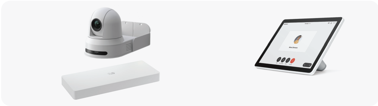
Figure 2. Default components of the Webex Room Kit Plus PTZ 4K bundle