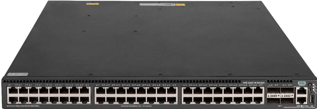
HPE 5600 HI 48P PoE8 MGig 4QSFP+ 1s Sw (S0S35A)