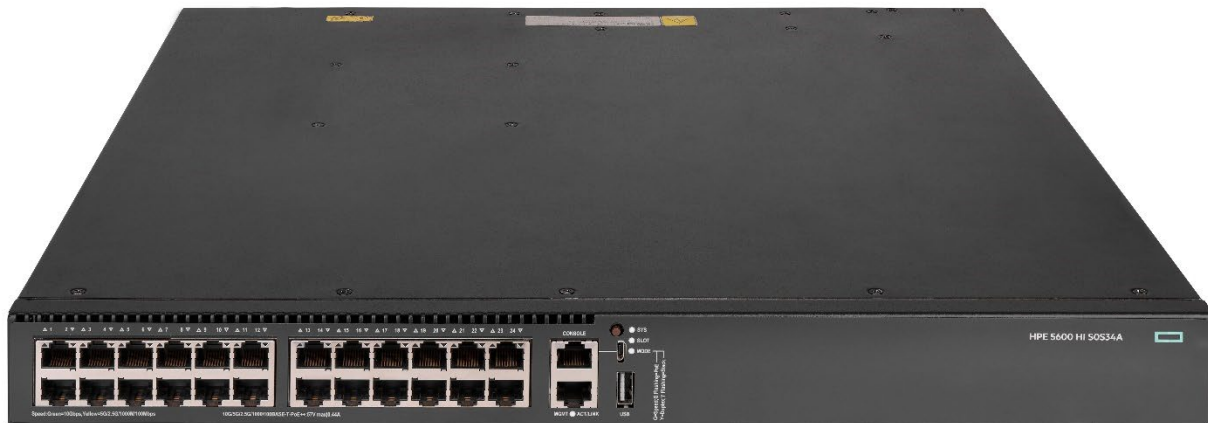
HPE FlexNetwork 5600 HI 24P PoE8 MGig 1 Slot Sw (S0S34A)

This Switch Series also includes Smart Management Center (SmartMC) at no additional cost and combined with HPE Intelligent Management Center (IMC), provides both embedded network management and enhanced network visibility.