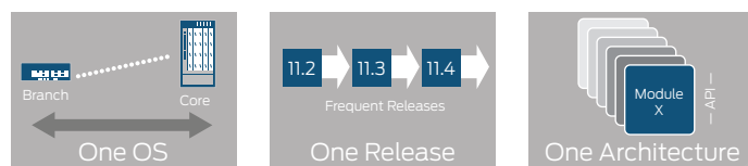
Figure 2: Junos OS utilizes a single source code, adheres to a consistent and predictable release train, and employs a single modular architecture.

These attributes are fundamental to the core value of the software, enabling all products powered by the Junos OS—routers and switches—to be updated simultaneously with the same software release. All features, new and old, are fully regression-tested, making each new release a true superset of the previous version. Customers can deploy a new Junos OS release with complete confidence that all existing capabilities will operate in the same way and be compatible on all Juniper Networks switches and routers in the network.