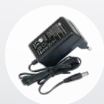
24V 1.2A Adapter