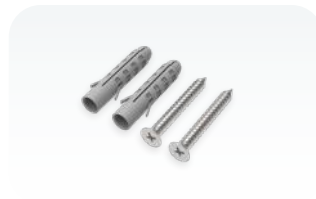
K-47 fastening set