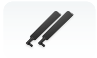
HGO indoor antenna kit