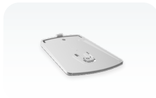
Base leg and pads