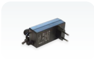
24 V 1.5 A power adapter