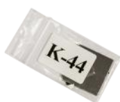
K-44 mount kit