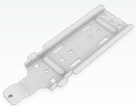
Outdoor case bracket