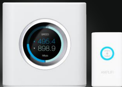
Teleport and Router Kit Model: AFi-RT