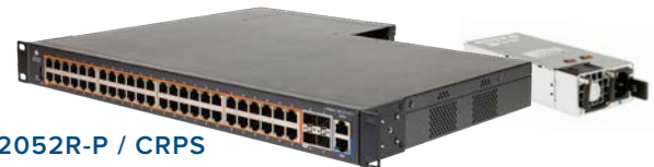
EX2052R-P / CRPS