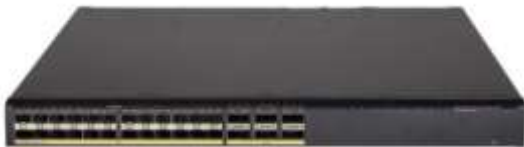
S6812-24X6C Front view