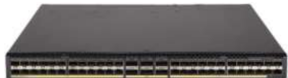
S6812-48X6C Front view