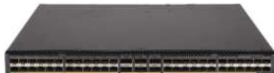
S6813-48X6C Front view