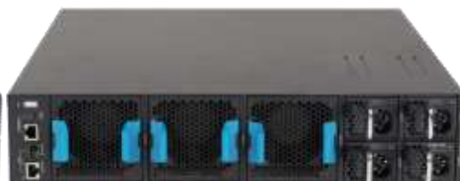
S9820-64H rear panel