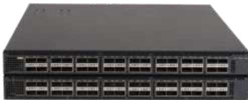
S9820-64H front panel