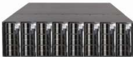
S9820-8C front panel