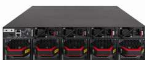
S9820-8C rear panel