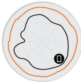
Figure 3. R750 5GHz Azimuth Antenna Patterns