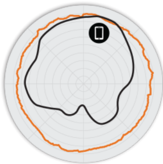
Figure 2. R750 2.4GHz Azimuth Antenna Patterns