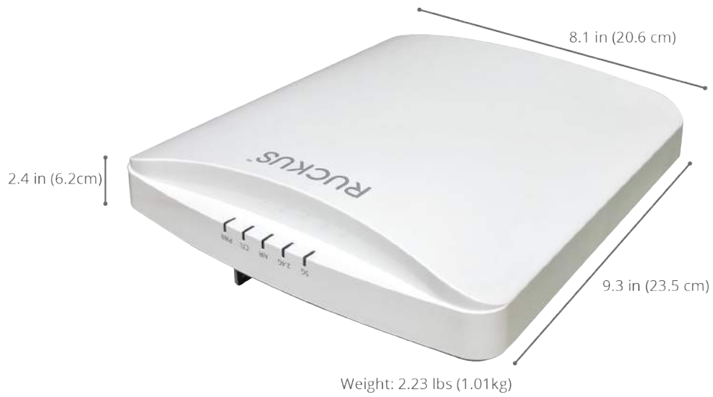
Weight: 2.23 lbs (1.01kg)