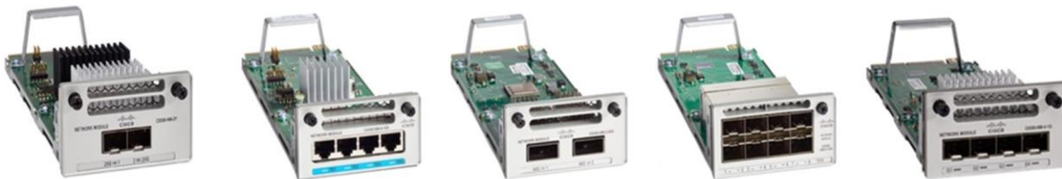
Figure 3. Cisco Catalyst 9300 Series Network Modules