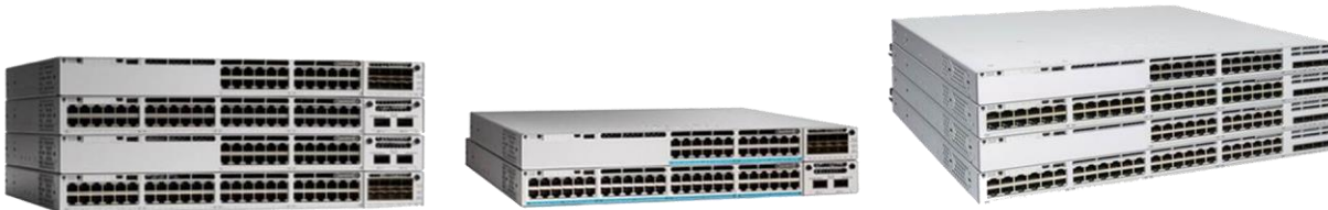
Figure 1. Cisco Catalyst 9300 Series switches

The Cisco Catalyst 9300 Series is made up of nineteen modular uplink switch models and fourteen fixed uplink switch models.