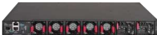
S6805-54HF Rear view