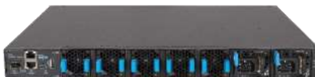
S6805-54HT Rear view