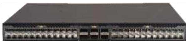
S6805-54HF Front view