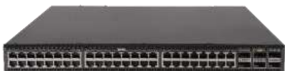
S6805-54HT Front view