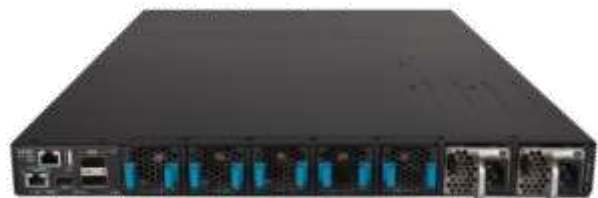
S6850-2C rear panel