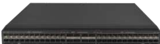
S6850-56HF front panel