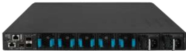
S6850-56HF rear panel