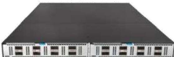
S6850-2C front panel