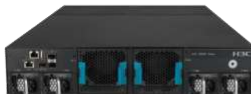
S9850-4C rear panel