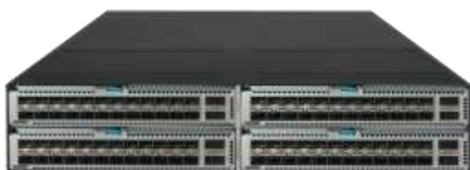
S9850-4C front panel