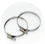
2x hose clamps