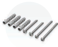
K-66 fastening set