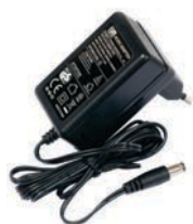
24V 0.8A power adapter