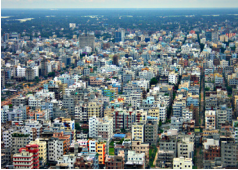
Dhaka, Bangladesh, May 12, 2018