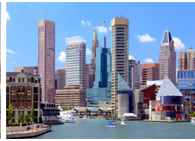
Baltimore, USA, April 12 - 13, 2018