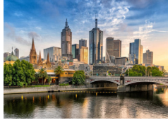
Melbourne, Australia, May 18, 2018