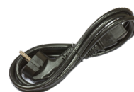
IEC power cord