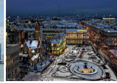
Minsk, Belarus, June 05, 2018