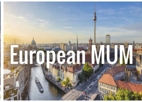
Berlin, Germany, April 05 - 06, 2018