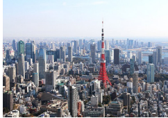
Tokyo, Japan, May 08, 2018