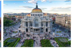
Mexico City, Mexico, April 16 - 17, 2018