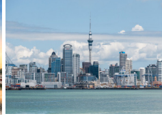
Auckland, New Zealand, May 21, 2018