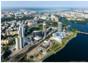
Ekaterinburg, Russia, March 13, 2018